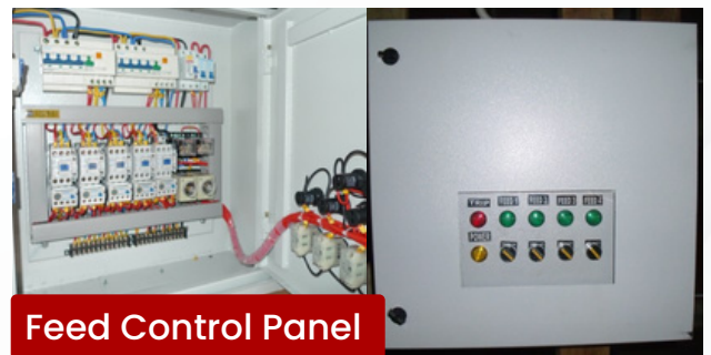
Feed Control Panel

Level switch regulate feed supply from Feed Bin. You can choose the level switch that can attaches to feed hopper or the level switch that fix to the drop pipe.