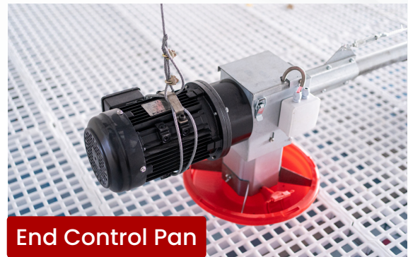
End Control Pan

Feed line can be lifted up and down by heavy duty winch and quality lifting components.