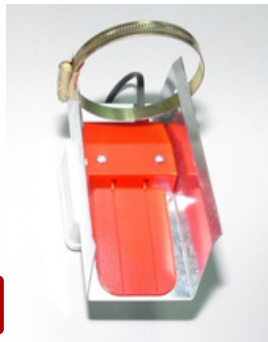
Feed Level Switches

Level switch regulate feed supply from Feed Bin. You can choose the level switch that can attaches to feed hopper or the level switch that fix to the drop pipe.