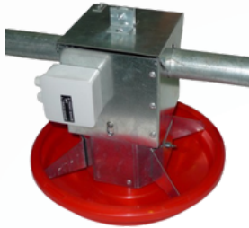
Mid Control Pan

Heavy Gauge Galvanized Steel Hopper with 50 Kg capacity or custom made for special application. Bottom boot with single or double outlet design.