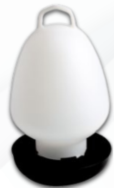
2 Galloon Drinker

Pristine Glory Sdn. Bhd. Poultry Equipment Manufacturer (Co. No.: 353246-W)