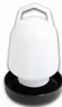
1 Galloon Drinker